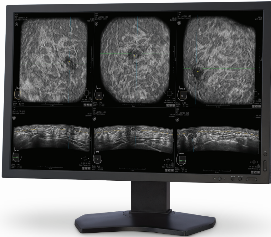
Invenia ABUS Viewer displays 3D volumes in a patented, 2-mm-thick coronal slice.

Invenia ABUS 2.0 uses the powerful cSound™ Imageformer, a software-based graphics processor, that provides a reproducible and operator-independent acquisition method to achieve consistent, high quality results. cSound imaging allows significantly more data to be collected and used to create every image. Traditional hand-held ultrasound parameters such as focal zones and gain are automatically optimized. Because no image manipulation is required, high image quality is consistent from operator to operator with the touch of a button.