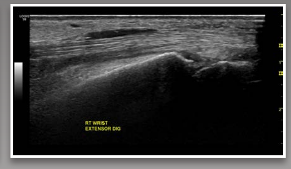
MSK imaging with ML6-15-D probe