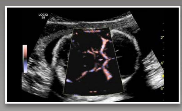
Fetal Circle of Willis flow using B-Flow HD Color with C1-6-D